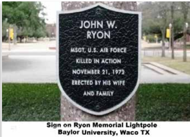
Sign on Ryon Memorial Lightpole Baylor University, Waco TX