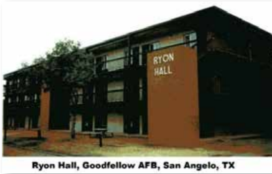
Ryon Hall, Goodfellow AFB, San Angelo, TX