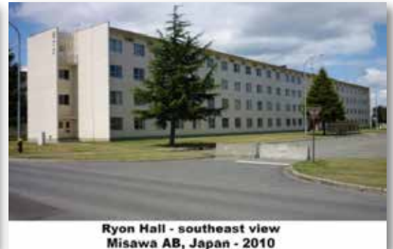
Ryon Hall - southeast view Misawa AB, Japan - 2010