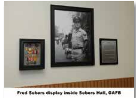
Fred Sebers display inside Sebers Hall, GAFB